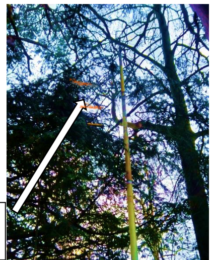
Reconstruction photo showing possible snagging of pull rope insert insulator, among overhead branches.