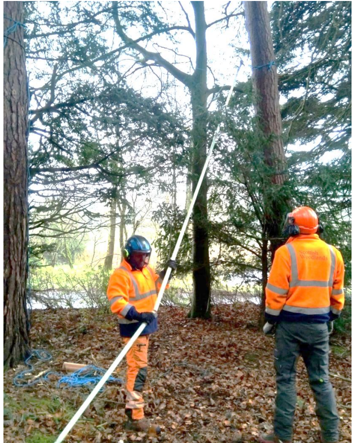
Reconstruction photo (using a section of blue rope) showing rods being assembled leaning against the overhead power line.

The operative working adjacent to the insulated rod operator was a trainee, with only the basic WI-PS authorisation level. As such the required levels of personal supervision were not as the SPEN authorisation skills matrix.