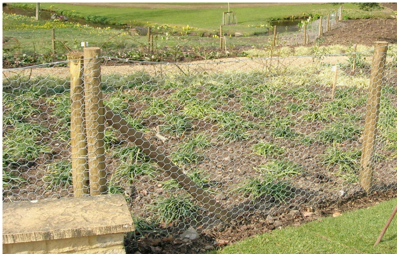
Permanent rabbit fence around new border planting

Temporary fencing around beds and borders can be very cost effective.