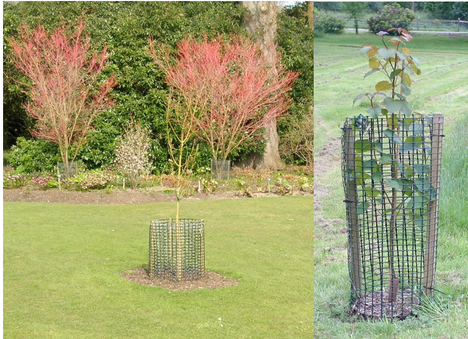
0.6m high rabbit guard and 1.2m high Roe deer guard

Tree guards, individual tree protection 2 , are available in a range of sizes, shapes and materials. They are most suited to areas where the trees and shrubs that are vulnerable to damage are few in number or have a scattered distribution. Guards require regular inspection and maintenance to ensure they remain effective. Once they are no longer required they must be removed to prevent them damaging the tree they were intended to protect.