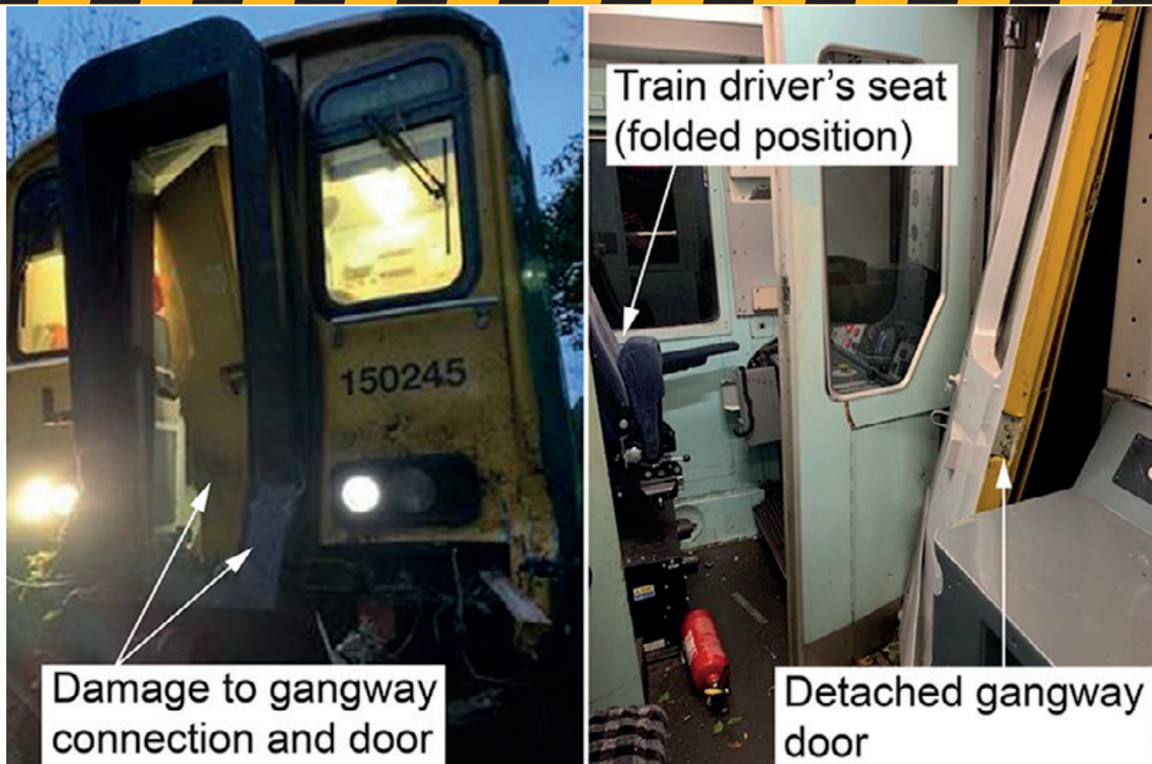
Damage to the train front and driving cab area