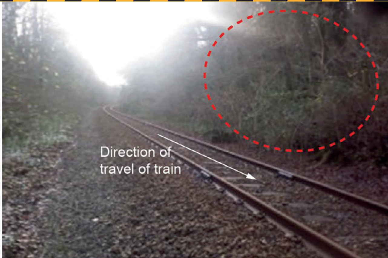
Pre-accident image with dashed line showing area from which trees fell

Network Rail has processes for assessing risk once a hazardous tree has been identified. These consider the number of and types of tree defect, the maximum permitted train speed, the likely size of the part of the tree that could be struck by a train, and the potential consequences, such as train derailment. The actions required as a result of these risk assessments vary from additional inspections, to closing the railway until the hazard has been dealt with. The processes involve contacting neighbouring landowners where necessary. None of these processes were applied at the accident site because no hazardous trees had been identified by Network Rail during its inspections.